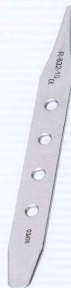
Descolador de Unha Nail File • R-832-10