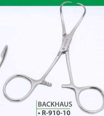
BACKHAUS • R-910-10