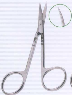
IRIS Reta / Straight • R-640-10 • R-640-12 Curva / Curved • R-642-10 • R-642-12