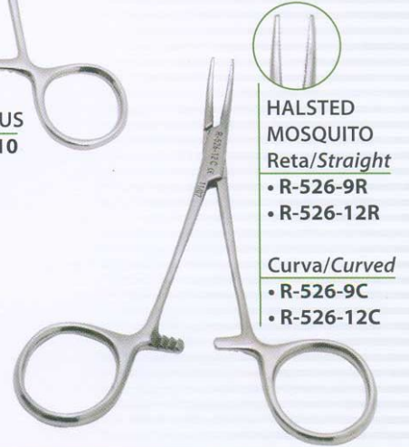
HALSTED MOSQUITO Reta/Straight • R-526-9R • R-526-12R