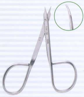
STEVENS LIGHT Reta Fina Straight Pointed - Ribbon • R-641-10A Curva Fina Curved Pointed - Ribbon • R-641-10B