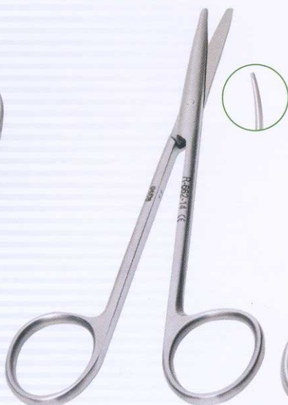
METZEMBAUM Reta e Leve / Straight Delicate • R-662-14 Curva e Leve / Curved Delicate • R-664-14