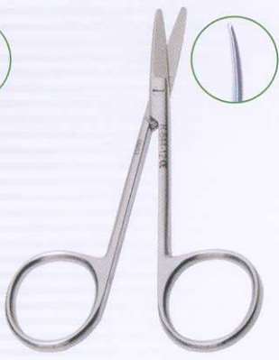
Reta e Leve (Romba-Romba) Straight Light (Blunt-Blunt) • R-644-12 Curva e Leve (Romba-Romba) Curved Light (Blunt-Blunt) • R-646-12