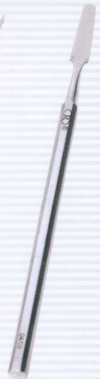
Espátula Descoladora p/ Fenol Spatule Nail Dissector for Fenol • R-554-15