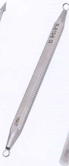
SCHAMBERG Extr. Comedão (Nacional) Comedone Extractor • R-810-10