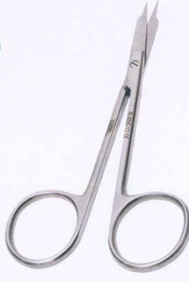
STEVENS Reta p/ Pontos Straight for Suture • R-656-12