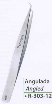
R-303-12 Angulada Angled • R-303-12