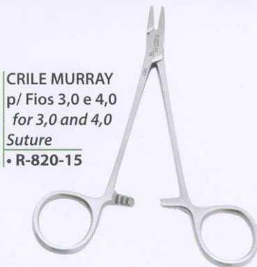
CRILE MURRAY p/ Fios 3,0 e 4,0 for 3,0 and 4,0 Suture • R-820-15