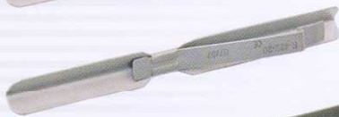
Locks 20 cc