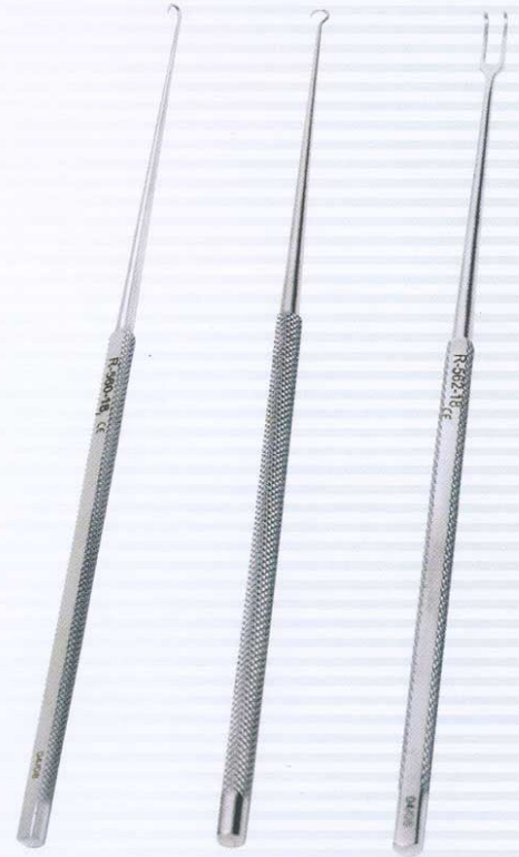
JOSEPH Delicado / Delicate • R-560-18