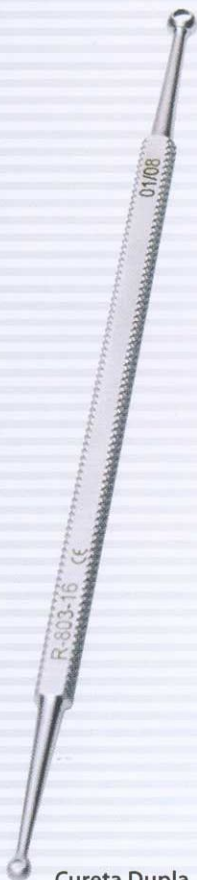
Cureta Dupla para Molusco Double Curette • R-803-16 aberta / Opened • R-803-17F fechada / Closed