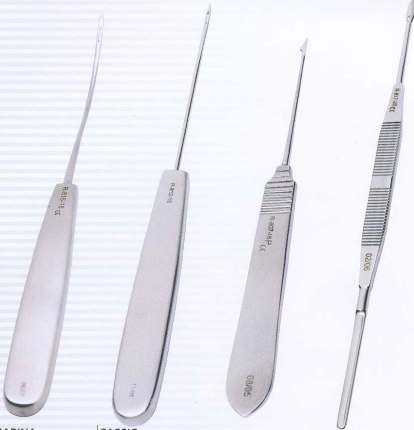
MARINA Agulha p/ Goretex Romba Goretex Needle Blunt • R-816-18