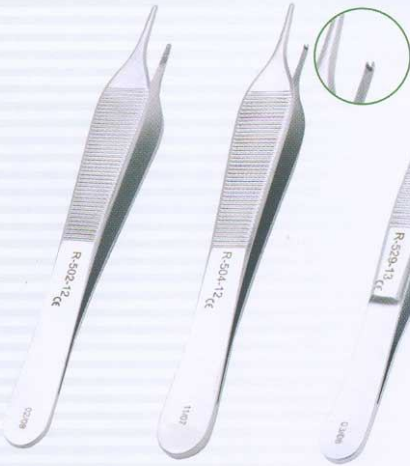
ADSON c/ Serrilha Serrated • R-502-12