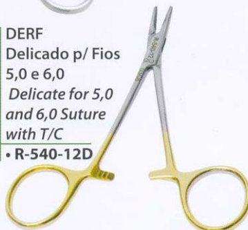
DERF Delicado p/ Fios 5,0 e 6,0 Delicate for 5,0 and 6,0 Suture with T/C • R-540-12D