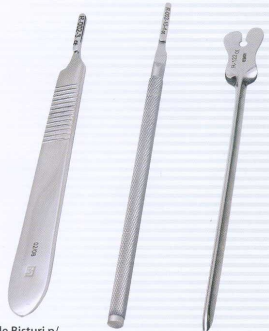
Cabo de Bisturi p/ Lâminas 10 a 15 Scalpel Handle for Blades 10 to 15 • R-002-3