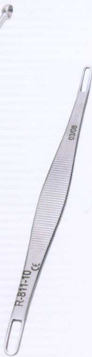
SCHAMBERG Extr. Comedão Comedone Extractor • R-811-10