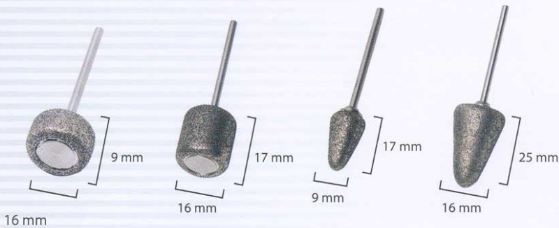
Mandril • R-763-M