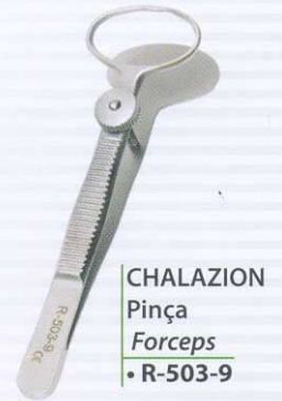
R-503-9 CHALAZION Pinça Forceps • R-503-9