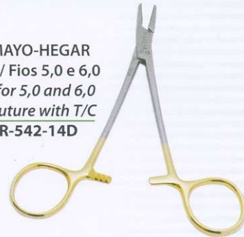
MAYO-HEGAR p/ Fios 5,0 e 6,0 for 5,0 and 6,0 Suture with T/C • R-542-14D