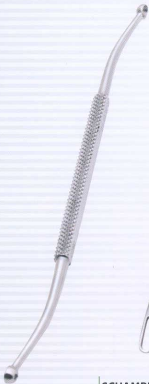
TUNNA Extr. Comedão Comedone Extractor • R-808-14