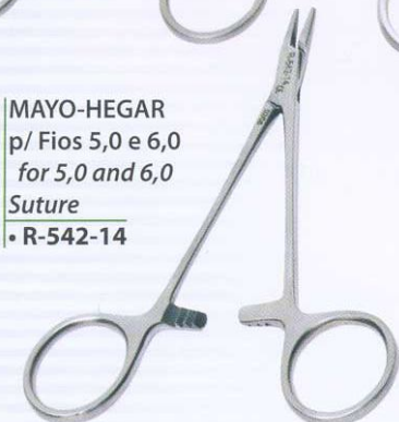
MAYO-HEGAR p/ Fios 5,0 e 6,0 for 5,0 and 6,0 Suture • R-542-14