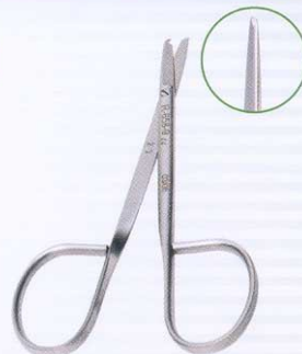
SPENCER LIGHT Para Tirar Pontos Stitch Remove - Ribbon • R-658-9 • R- 659-11