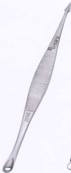
SAAFELD Extr. Comedão (com lanceta) Comedone Extractor • R-809-11