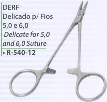
DERF Delicado p/ Fios 5,0 e 6,0 Delicate for 5,0 and 6,0 Suture • R-540-12