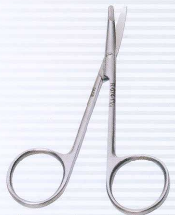
KILNER Curva e Leve / Curved Light • R-674-11