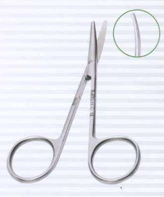
METZEMBAUM Reta e Leve Straight Delicate • R-670-11 Curva e Leve Curved • R-670-11C