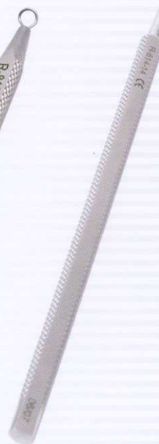
Aguilha p/ Millium (triangular) Millium Knife • R-814-14