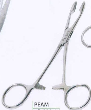
PEAM • R-822-14