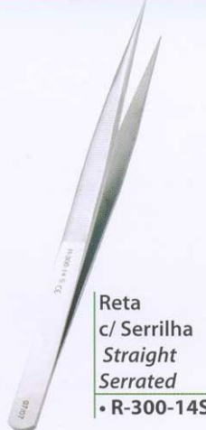
R-300-14S Reta c/ Serrilha Straight Serrated • R-300-14S