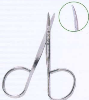
Reta (Romba-Romba) Straight (Blunt-Blunt) - Ribbon • R-643-10A Curva (Romba-Romba) Curved (Blunt-Blunt) - Ribbon • R-643-10B