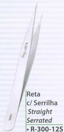
R-300-12S Reta c/ Serrilha Straight Serrated • R-300-12S