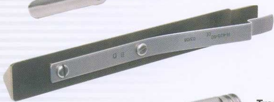
Locks 60 cc