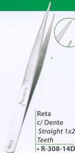
R-308-14D Reta c/ Dente Straight 1x2 Teeth • R-308-14D