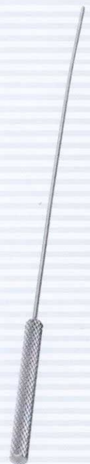
LIEBERMANN Estilete p/ Algodão Cotton Applicator • R-766-15