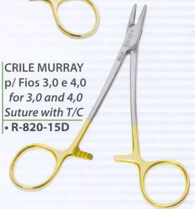
CRILE MURRAY p/ Fios 3,0 e 4,0 for 3,0 and 4,0 Suture with T/C • R-820-15D