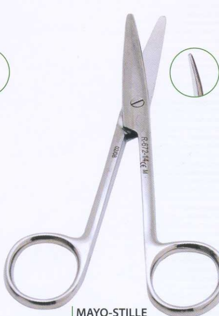
MAYO-STILLE Reta / Straight • R-672-14 Curva / Curved • R-673-14