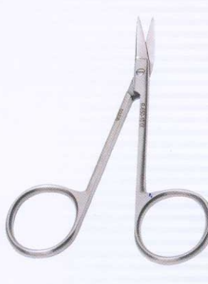
CONVERSE P/ Acrocordum For Acrocordum • R-650-10