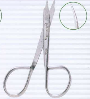
STEVENS LIGHT (One Blade Serrated) Reta / Straight - Ribbon • R-661-11A Curva / Curved - Ribbon • R-661-11B