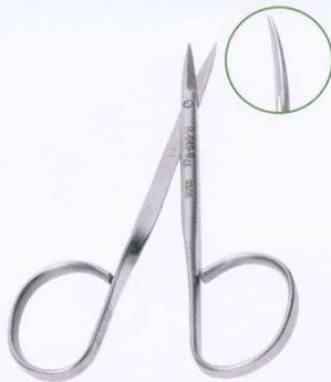
IRIS LIGHT Reta / Straight - Ribbon • R-649 - 9 Curva / Curved - Ribbon • R-651 - 9