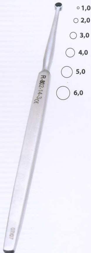
Curetas Dermatológicas Dermal Round Currettes • R-802-14