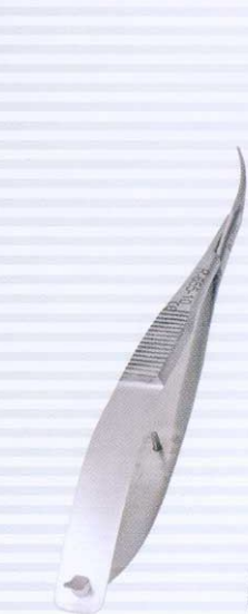
CASTROVIEJO Tesoura p/ Syringoma Scissor • R-655-10 For Removal of Syringoma