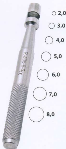
PUNCH Dermatológico Dermal Punches • R-806-9